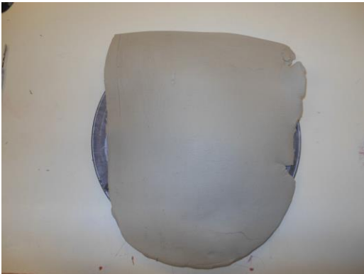
Clay over paper

Laying the clay over the paper: Using a needle tool cut off the excess clay.