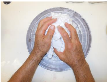
Wadding up paper towels

Ball up paper towels or newspaper to create the general shape of your face. Place the balled up paper towels on a large bat and secure it with masking tape. Add additional paper to form the location of your nose and secure it with masking tape.