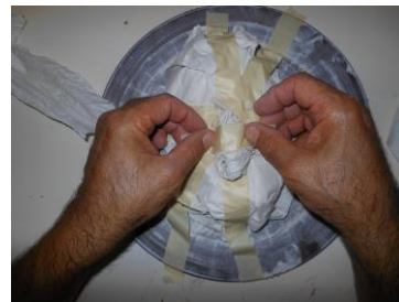
Adding a nose

Laying the clay over the paper: Using a needle tool cut off the excess clay.