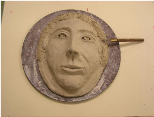
Using a wire tool to capture hair