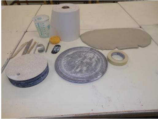
Slab of clay and tools