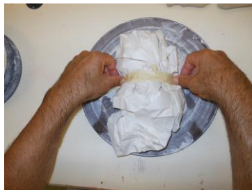
Taping it onto Bat