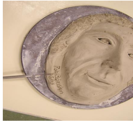
Signing the sculpture

Finishing touches: Spray the finished mask with water. Dip a brush in water and/or use a wet sponge to smooth out all the lines.