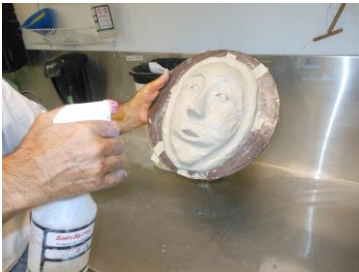
Spraying the finished head

Finishing touches: Spray the finished mask with water. Dip a brush in water and/or use a wet sponge to smooth out all the lines.