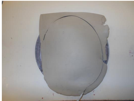
Cutting off excess clay

Sculpting the mask: To help create the features, use any tool you think will help. Keep the picture of your face next to the sculpture and refer to it frequently. Touch your face and compare what you feel to what you see.